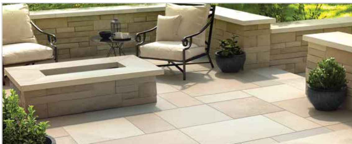
Highpoint paver pattern.