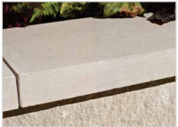
Sill used as a smooth edge wall cap.