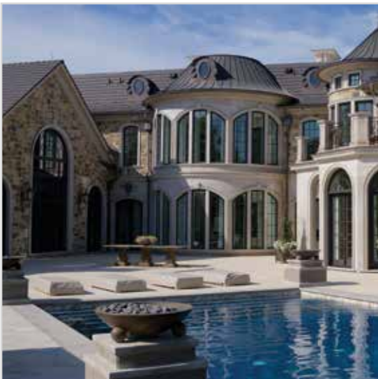
Custom pool coping and window trim.