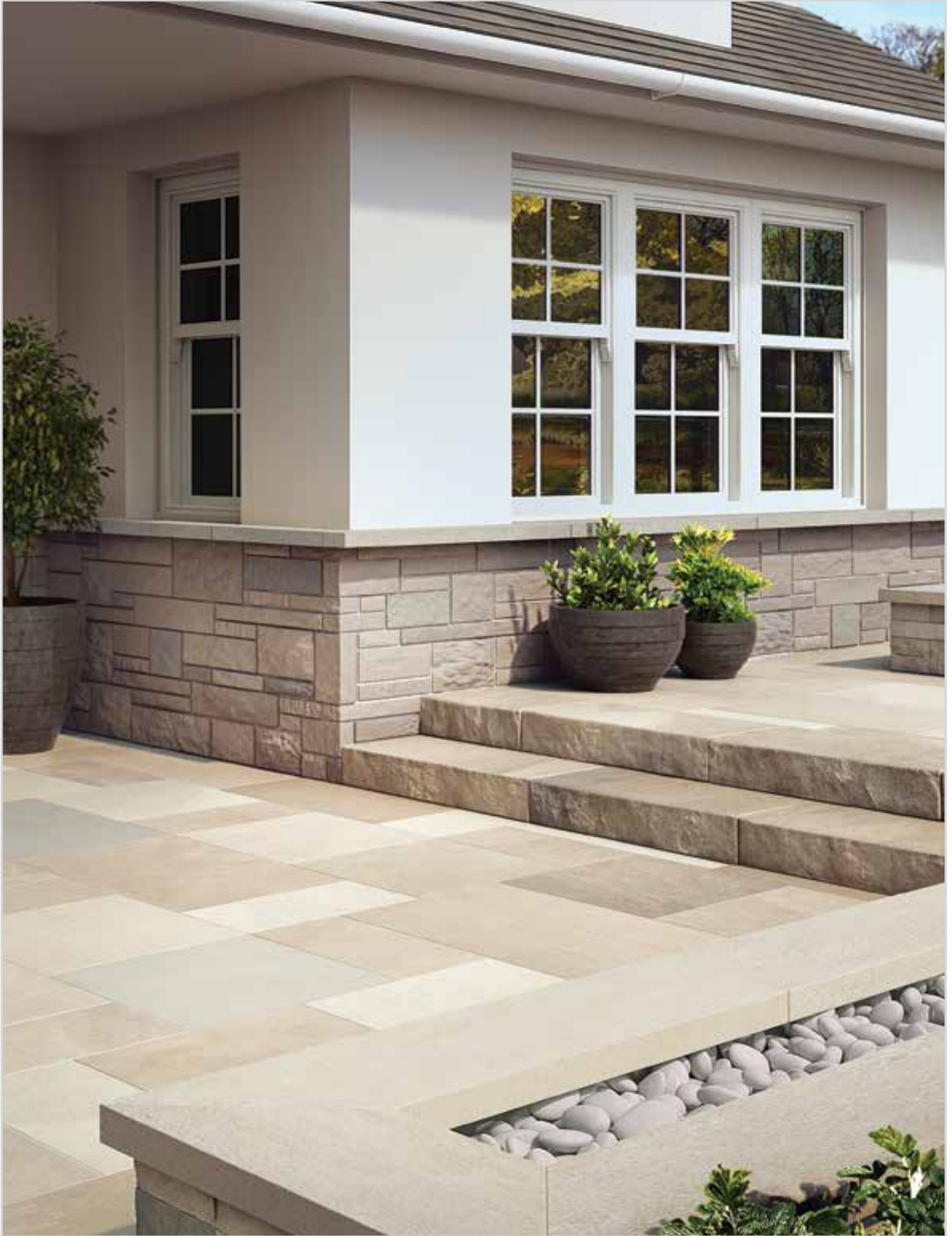
Highpoint paver pattern, 3" and 6" garden wall in ashlar pattern, sills used as wall caps. Estate Veneer Series Berkshire cladding on home.