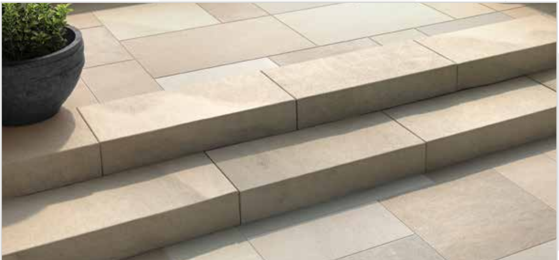
Garden steppers with Highpoint paver pattern.