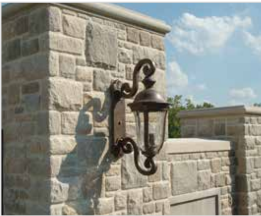
Random sized stones pattern.