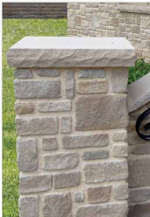
Rock face pier cap.