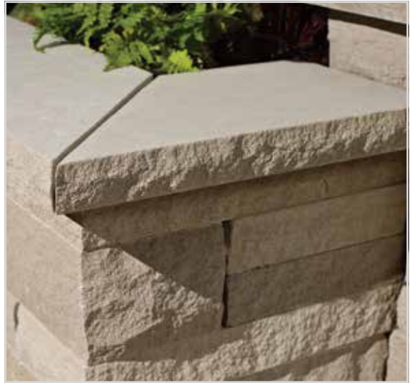
Rock face wall cap.