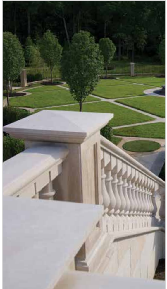
Custom pier caps and wall caps.