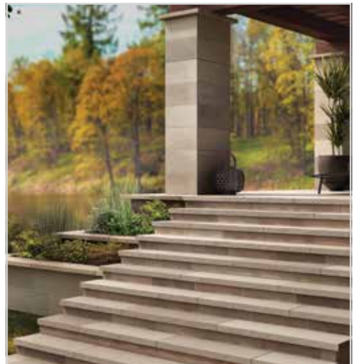
Treads, and Vanderbilt thin veneer columns.