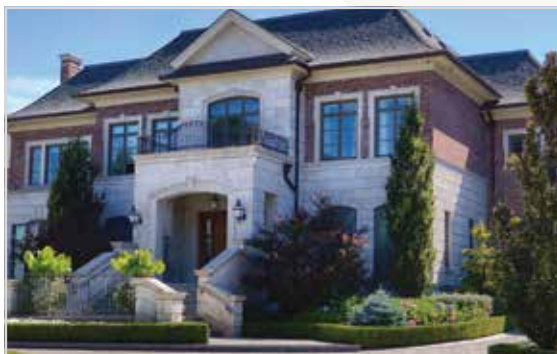
Mix the the smooth and clean look of Vanderbilt with other building materials.