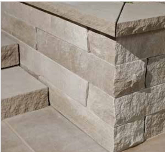
6" height in a bonded pattern for a more massive, monolithic look.