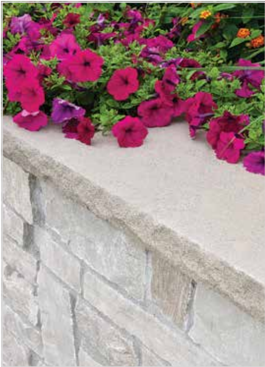
Rock face wall cap.