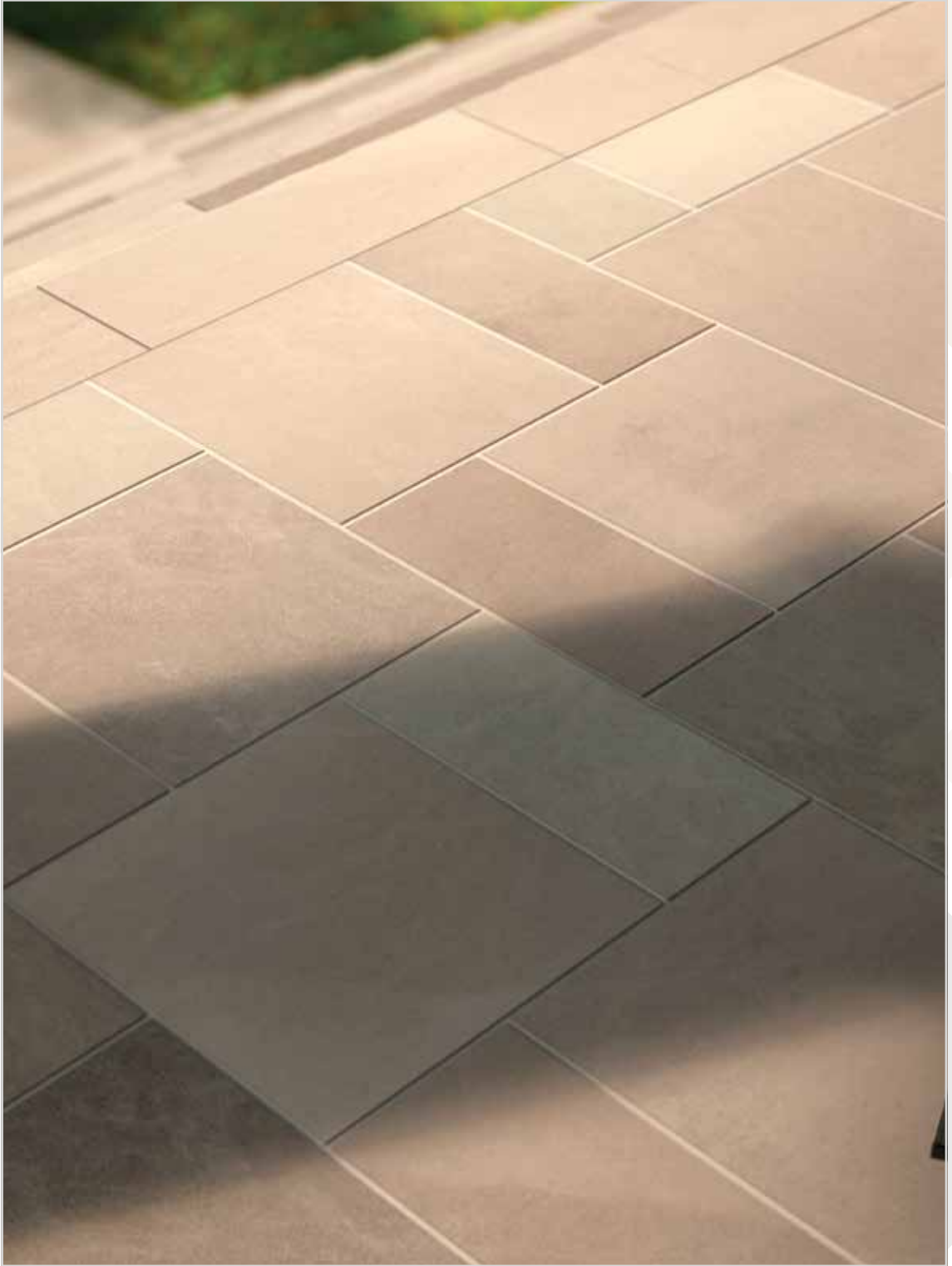
Modesto paver pattern.