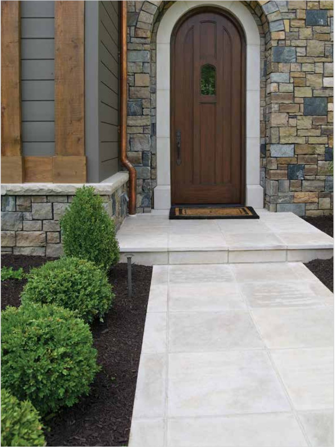
24" x 24" Standard size pavers.