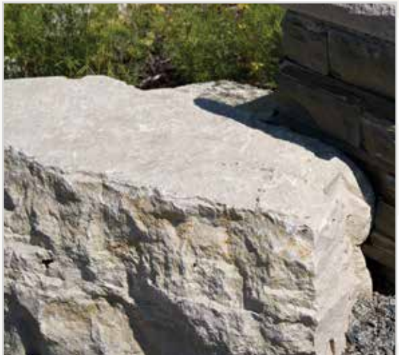
Large sized boulder.