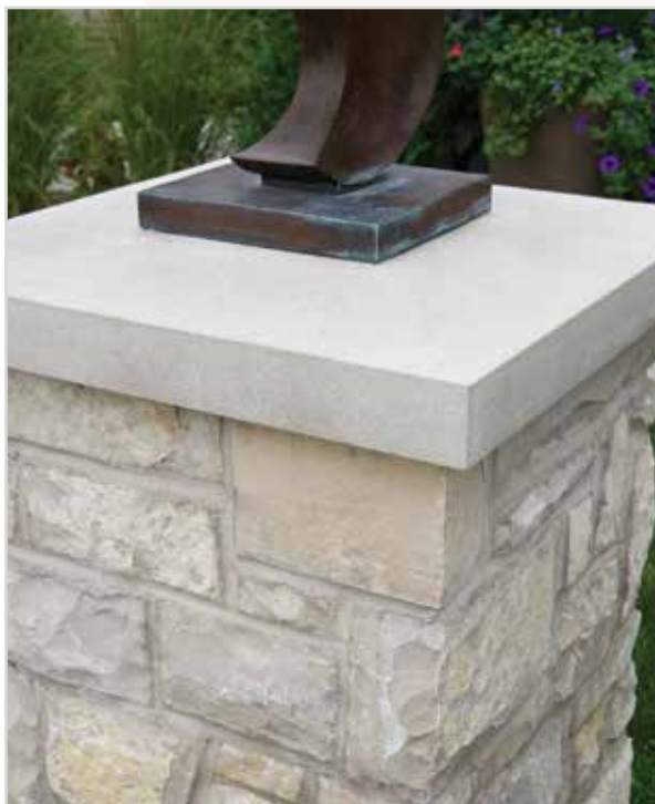
Square edge pier cap.