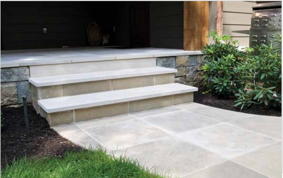
24" x 24" Standard size pavers.