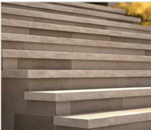
Vanderbilt thin veneer with treads.