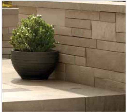
3" and 6" ashlar pattern for a more dynamic look.