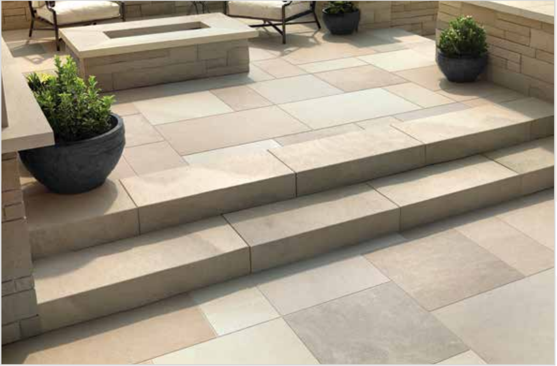
Highpoint paver pattern.