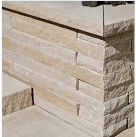
3" height in longer lengths for a more contemporary look.