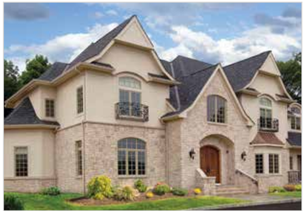
Consider mixing the split and tumbled look of Rockford to contrast smoother building materials.