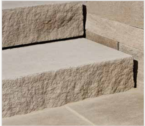
Garden stepper: Split front, back, and ends with sawn top and bottom.

Garden Steppers lend a sense of weight and permanence by creating step elements from single pieces of Indiana Limestone. Our steppers add an inviting touch to any landscaping area