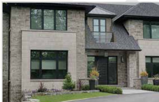
Vanderbilt veneer shown in running bond pattern.