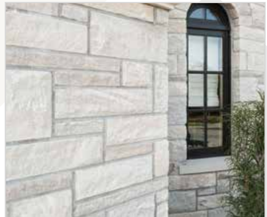
Ashlar pattern shown in four course heights.